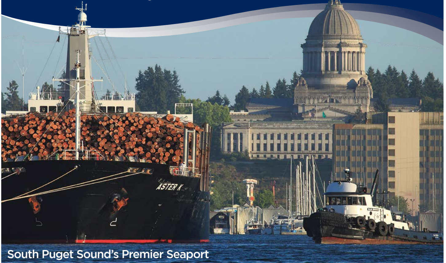
South Puget Sound's Premier Seaport