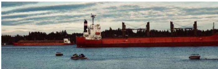
The Lodestar Princess departing the Port fully loaded with logs destined for China, as the Global Gold makes its way to the Port to be loaded with logs destined for Japan.

Thanks to new ship calls, import/export activity continued at a brisk pace in the third quarter at the Port of Olympia.