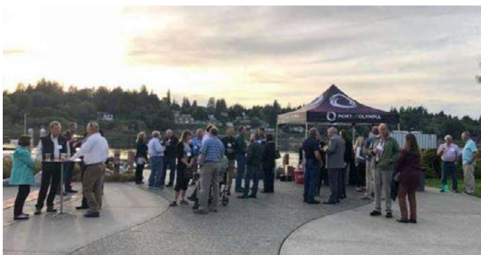
The Port of Olympia and Port Blakely hosted a reception during the Forest Resources Association Western Region Fall Meeting.

The Forest Resources Association represents the interests of nearly 300 organizations and businesses in the forest products industry. They all share common interests- they rely on the Forest Resources Association to promote the public policy interests of the forest products industry's supply chain on Capitol Hill and our work to advance operation efficiencies, supply chain relations and technical advancement. For more information, click here .